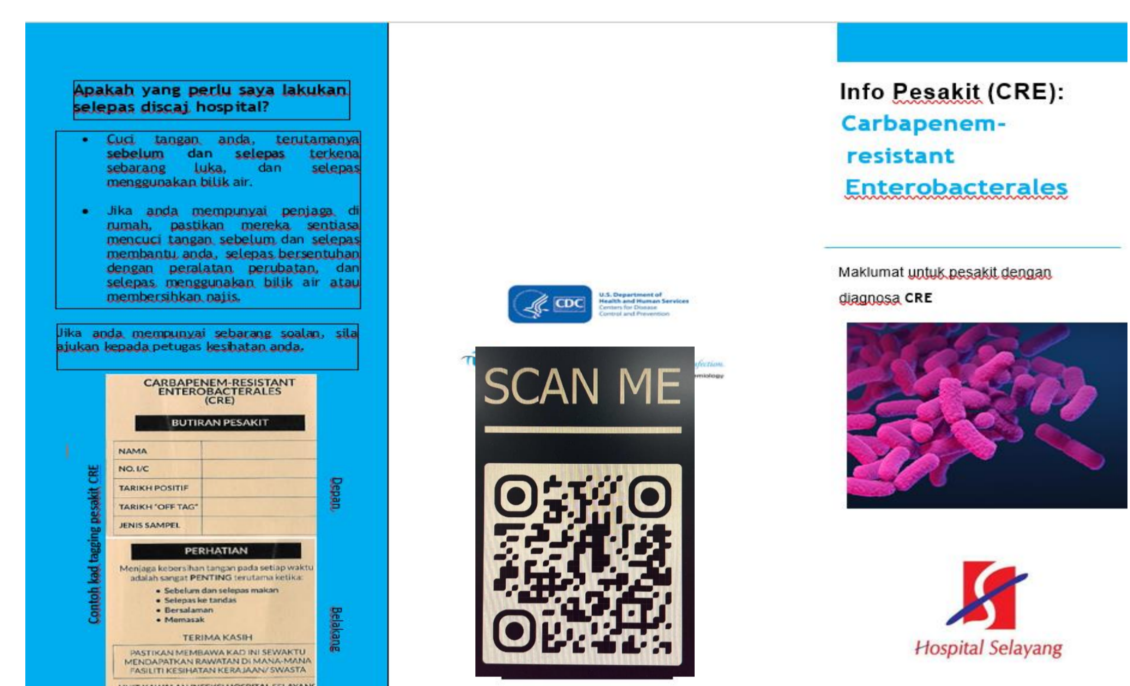
Fig 3: Educational printed handouts for patients diagnosed with CP-CRE infections with QR code for complimentary video.